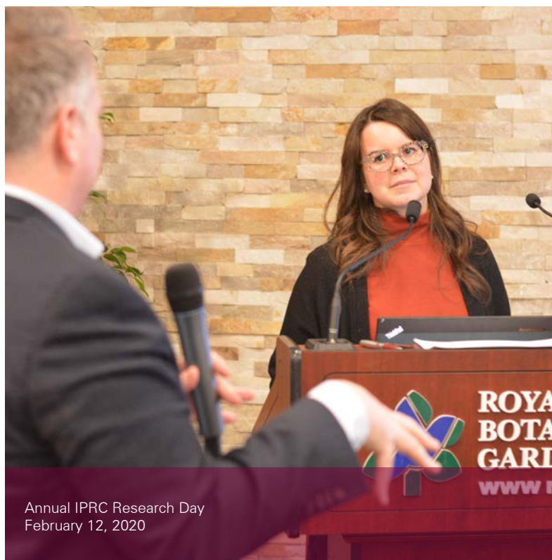
Annual IPRC Research Day February 12, 2020