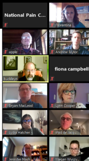
Screenshot of Canadian Pain Care Forum Meeting May 1st, 2020 – Virtual Meeting